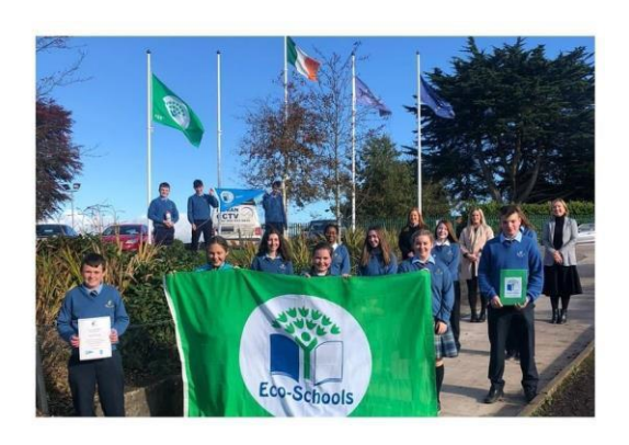
BHC Green Schools Committee 2nd Green Flag!

Greenschool's is a cornerstone of Monaghan County Council's litter awareness campaign. Schools continue to participate in the programme on an annual basis. At end of 2020 total registrations for the programme was 71 schools, 1 pre-school, 11 secondary schools and 59 primary schools. Staff members visit primary and secondary schools throughout the county to talk to students on a wide range of environmental issues with litter related matters, being especially popular.