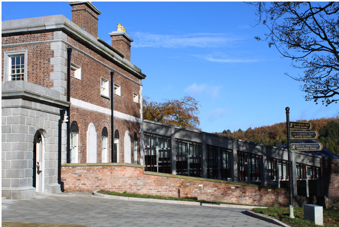
Lough Muckno gate lodge 2-Castleblayney Library