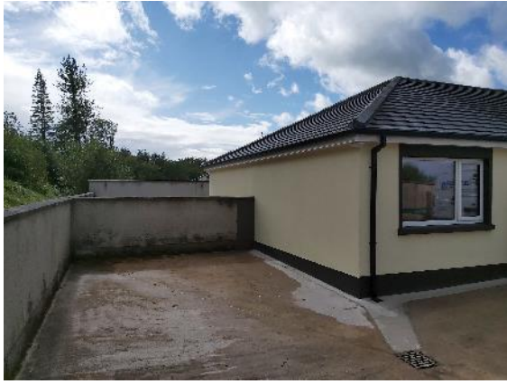
1 Bedroom extension