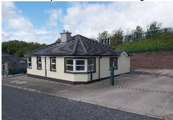
2 Bedroom conversion externally