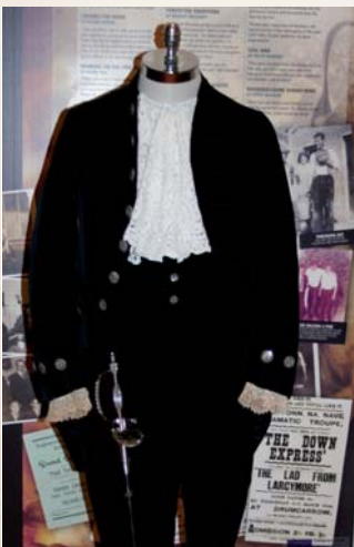
Full Court Dress including sword and hat donated anonymously