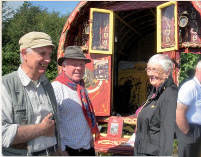
Images from our second successful Heritage Day held in Gavan Duffy Park in August 2011