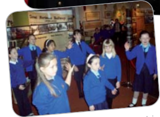
St Louis Girls' National School involved in the activities of the Magic Miles Workshop