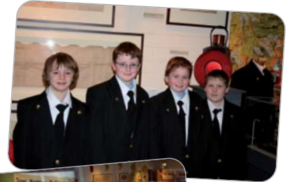
St Marys Boys' National School pupils dressed up in replica uniforms

The three designed for the Magic Miles in Monaghan exhibition have been very successful. They are Puppet Making, Working on the Railway and one entitled Tour of Exhibition. Depending on the workshop selected, children can dress up in replica uniforms, practise hand signals, work on a jigsaw or on an activity book. All workshops must be booked in advance. Contact Pauline on 047 82928 or email ptilson@monaghancoco.ie