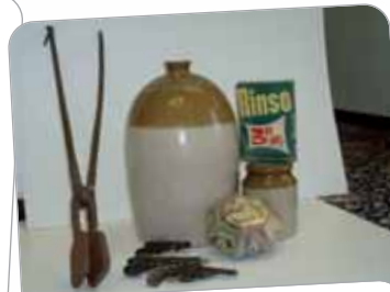
Earthenware whiskey jar and jam jar, trinket box, decommissioned small firearms, packet of Rinso washing powder and tongs used to make impressions on communion bread