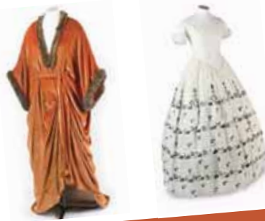
Springhill Costume Collection Ages of Elegance 1750 - 1950

An exhibition, featuring 12 recently conserved and restored pieces from the Springhill Costume Collection, opens in the museum in November 2007. It offers a unique opportunity to view some stunning costumes from past ages. This is a National Trust exhibition and further details will be available later in the year.