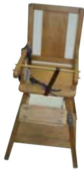
Baveystock High Chair dating to 1950s