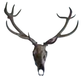
Skull and antlers of a Red Deer , dated by the National Museum to be between 8,000 and 11,000 years old.

The museum would like to thank the donors of these and other items received recently. Some new acquisitions will soon be on display in the Motor Tax Office in Monaghan town.