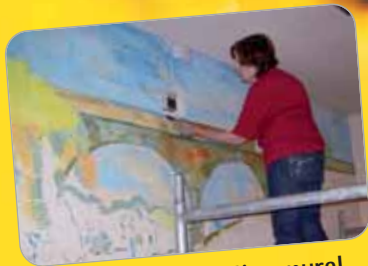
Local artist painting mural