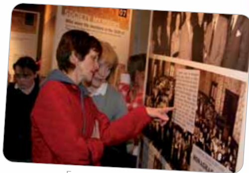
Engrossed in the exhibition

The Museum hosted a very interesting exhibition from April to June this year. I heard they went to New York was a photographic exhibition which recorded the history of the Monaghan Society in New York.