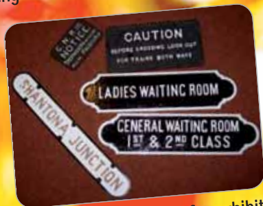
Newly painted signs ready for exhibition