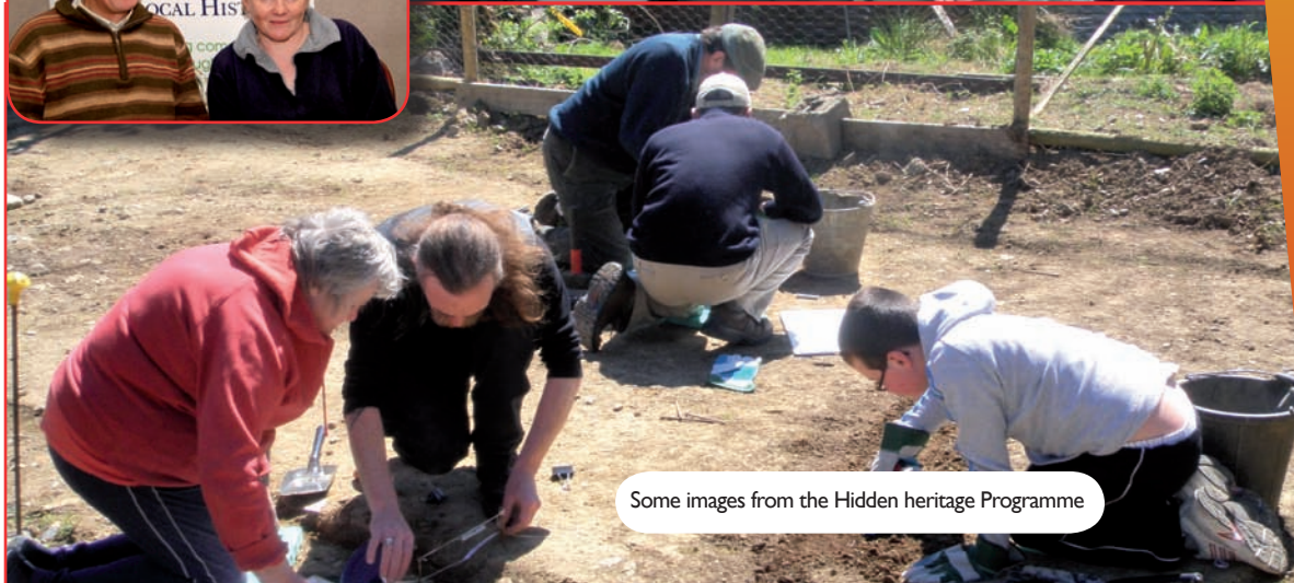
Some images from the Hidden heritage Programme