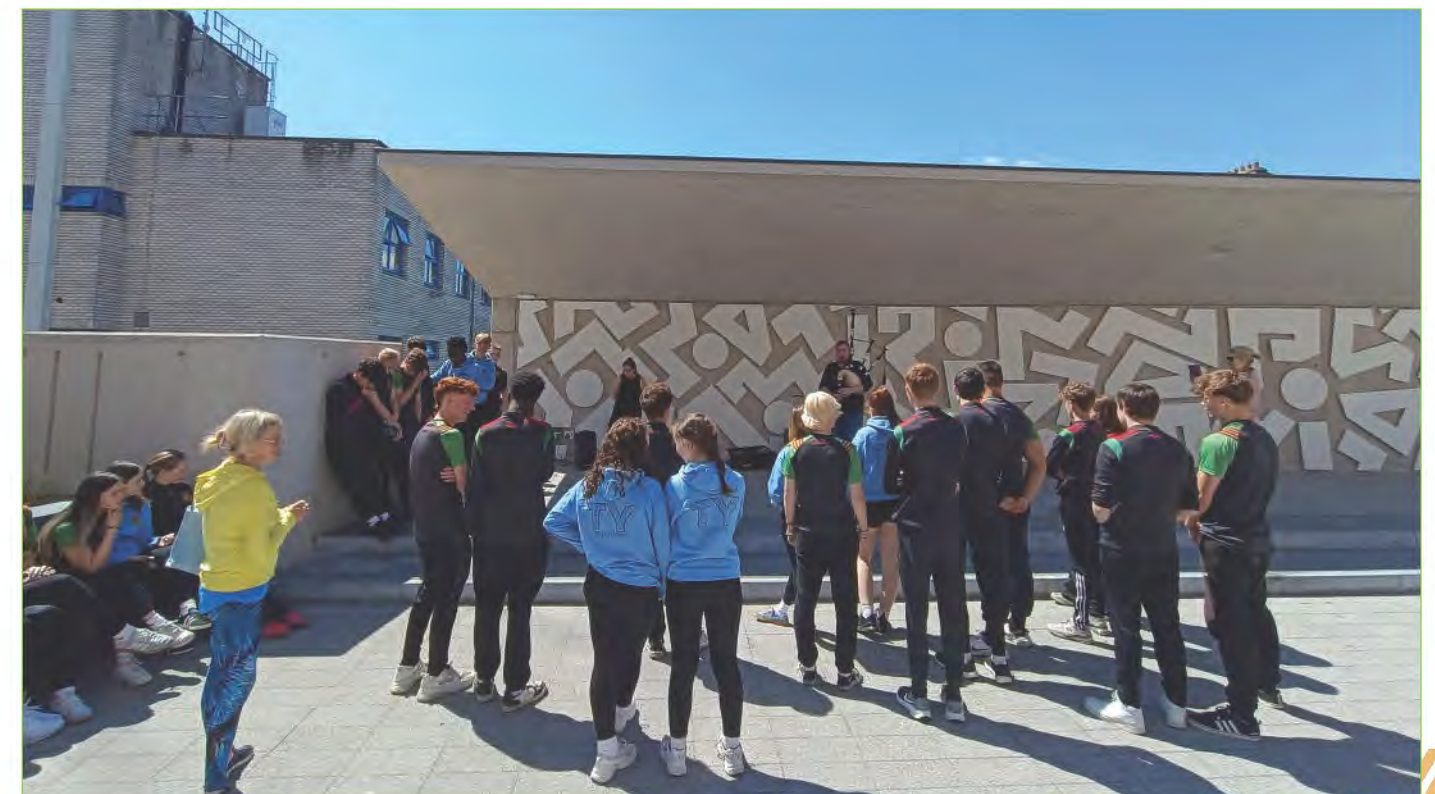
Students from the Royal School, Cavan listening to the piper.

In May, the museum hosted a pilot event where the Ulster Scots Agency invited schools from the area to a workshop on the history and heritage of Ulster Scots. On the day the sun shone and the students were able to enjoy music from a piper and some traditional dancing at the outdoor stage of the Peace Campus.