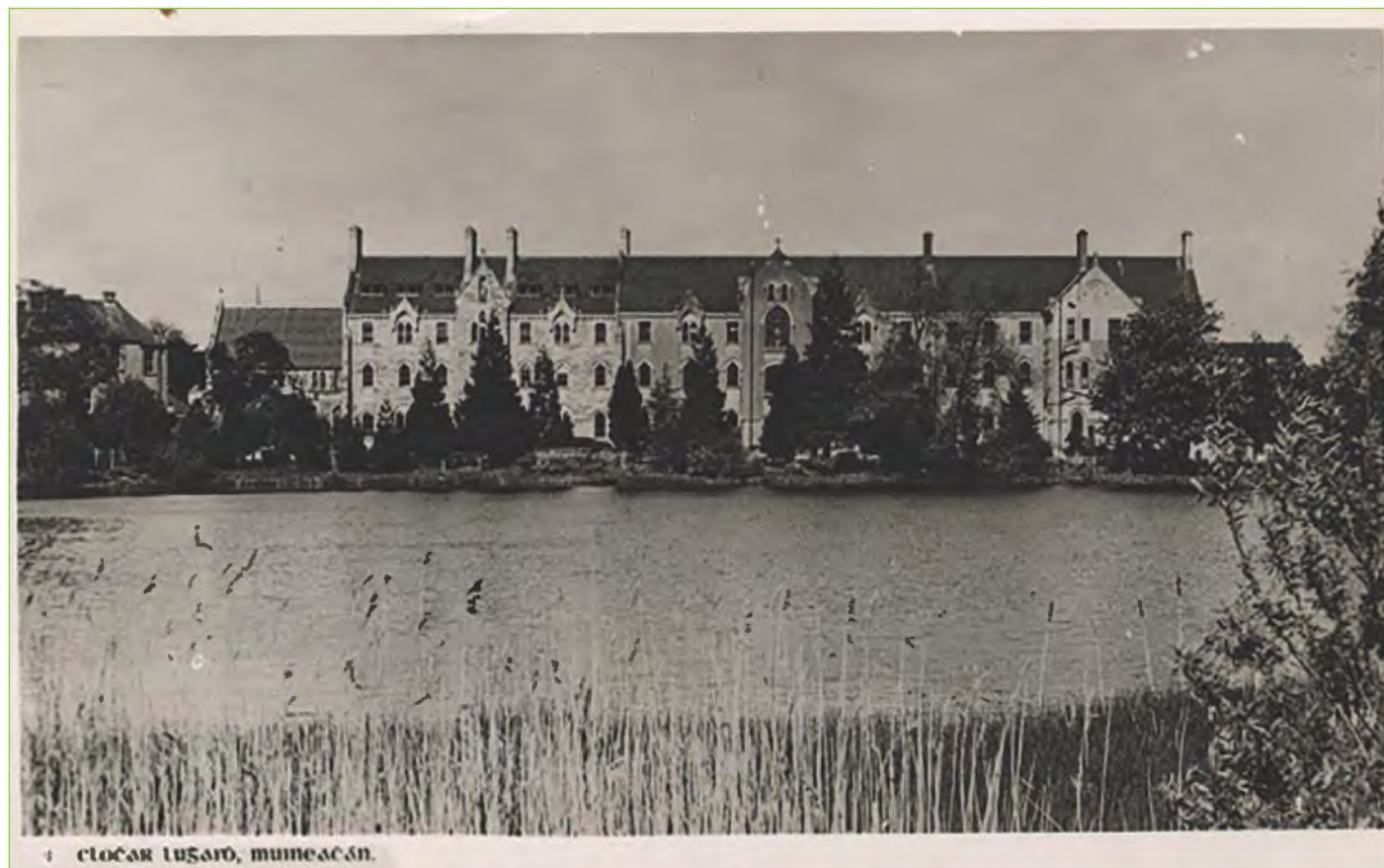
A postcard from the museum's collection of the St. Louis Convent photographed from across the lake.

In early March the Sisters of St. Louis closed their Monaghan Convent after 166 years in the town. To mark this historic event in the county an exhibition charting the history of the St. Louis Order, from their arrival in 1859 to Mill Street in Monaghan Town went on display, just for one day at the St Louis Secondary School. To allow more visitors the exhibition moved to Monaghan County Museum in the Peace Campus for the rest of the month. Many past pupils of the three schools run by the Order took the chance to visit this excellent exhibition that marked the end of the era of the St. Louis nuns in Monaghan Town.