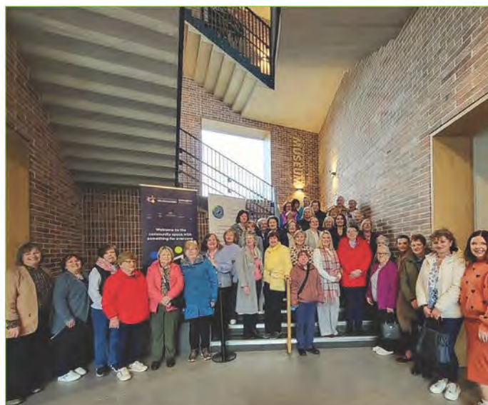
Irish Women's Collective Monaghan celebrating International Women's Day at Monaghan County Museum.