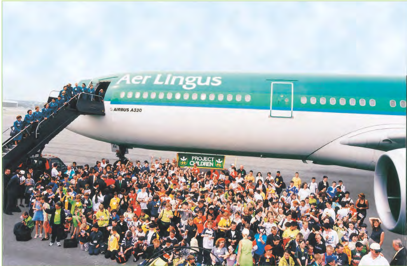
Project Children participants arriving at JFK airport

What began in 1975 when 6 children, three Protestant and three Catholic, came to New York expanded into a project that would see 23,000 children from Northern Ireland having the opportunity to experience summers free from the threat of violence back home. To mark the 50th Anniversary of its inception the archive has arrived at the Monaghan Peace Campus which will serve as its permanent home. From October 7th – 11th a series of events will take place to mark this anniversary of Project Children including the official launch of the archive at Monaghan Peace Campus and its accompanying exhibition.