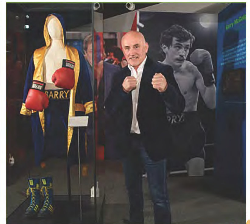
Even Tommy Bowe and Barry McGuigan, who feature in our Bordering Realities - Monaghan People & Stories Exhibition popped in to say 'hello'!