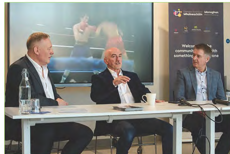
Barry discussing his World Championship fight.

In April we were delighted to welcome Barry McGuigan back to the museum. He was here to talk about the upcoming 40th anniversary of his world title win against Eusebio Pedroza and to promote the special event commemorating his historic victory that was held in the Hillgrove Hotel, Monaghan on Sunday June 8th.