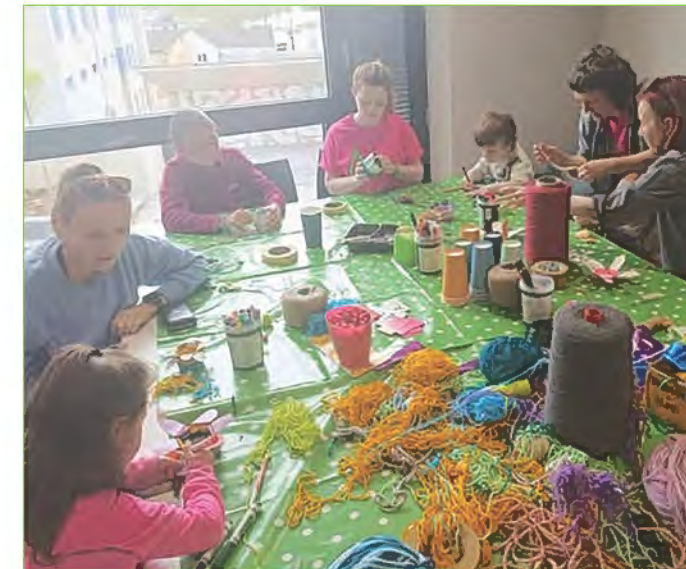
Participants weaving Easter baskets at the museum's workshop

of basket weaving using items easily found or recycled from material found around the home. Great fun was had and each participant got to take their own Easter basket masterpiece home.