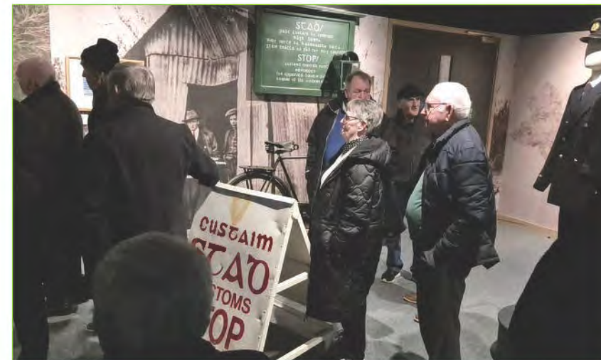
The Toplink Group from the Rural Health Partnership enjoying their visit.