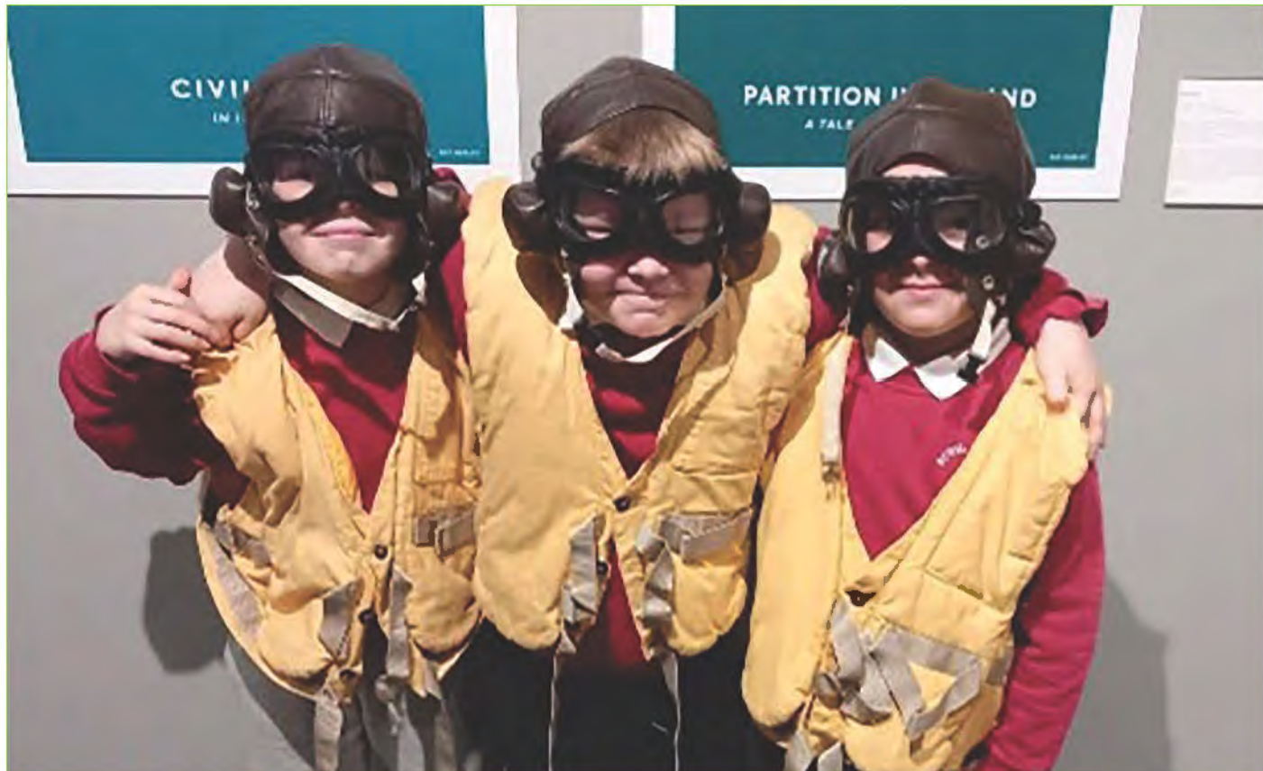
Pupils from Scoil Phádraig, Carron, Tyholland on a visit to the museum.