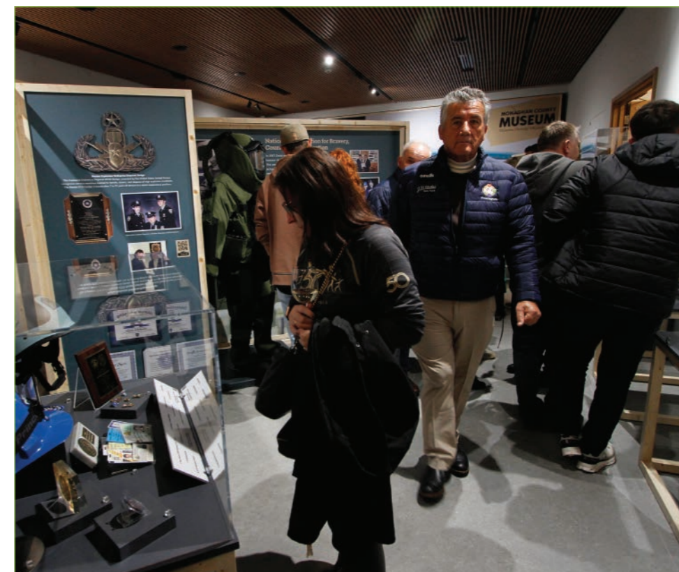
Visitors perusing the The Project Children Stories exhibition.