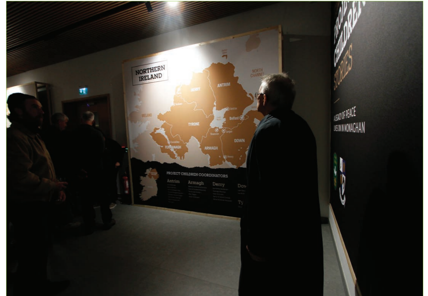
Map in the exhibition showing the Project Children Coordinator locations across Northern Ireland.