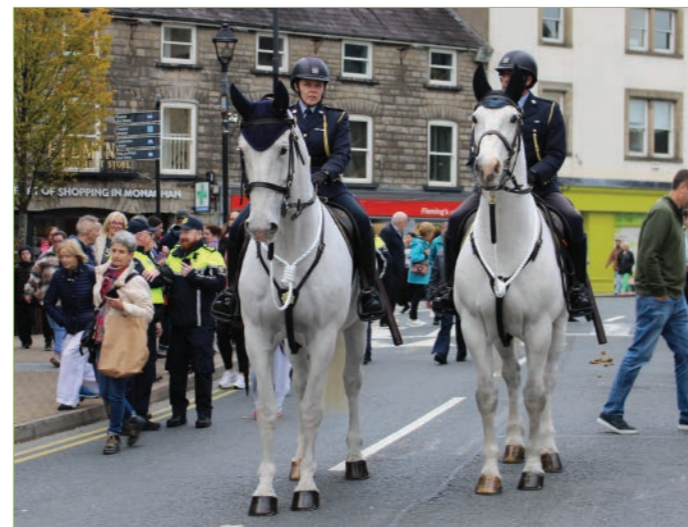
The Garda Mounted Support Unit parading in Monaghan.

The Garda Band were accompanied by their colleagues from the Garda Ceremonial Unit, and Mounted Support Unit as they processed through the town.