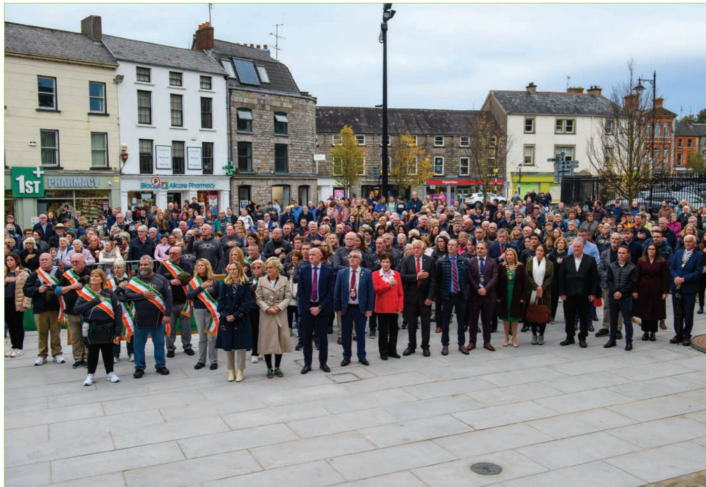
The crowds gathered at the Court House in Monaghan Town for the launch of The Project Children Stories.

The Garda and New York Police Department (NYPD) Pipe and Drums bands came into formation on the square in preparation for a parade which would take them, along with a large contingent of Project Children visitors from the US, Northern Ireland and further afield, to the Peace Campus for the official launch of 'The Project Children Stories – A Legacy of Peace lives on in Monaghan'.