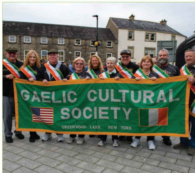
Members of the Gaelic Cultural Society visiting for the launch of The Project Children Stories.