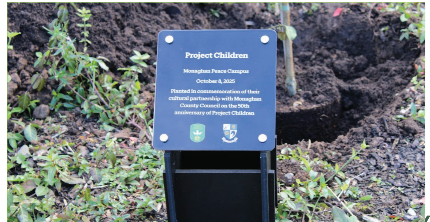
Plaque commemorating the cultural partnership between Monaghan Co. Council and Project Children at the Peace Campus.