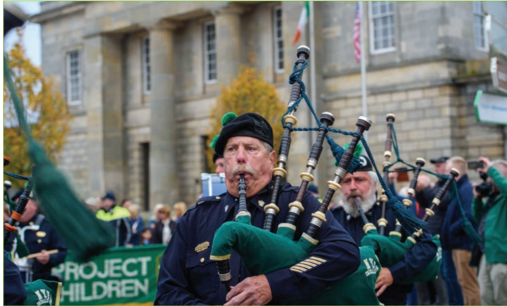
The NYPD Band parade through Monaghan Town to the opening of the The Project Children Stories exhibition at the Peace Campus.

Leaving the Court House, the NYPD Band and Garda Band made a splendid sight as they led the parade through the town via the North Road towards the Peace Campus. This represented yet another historic moment as it marked the first time the two bands marched and played together in Monaghan.