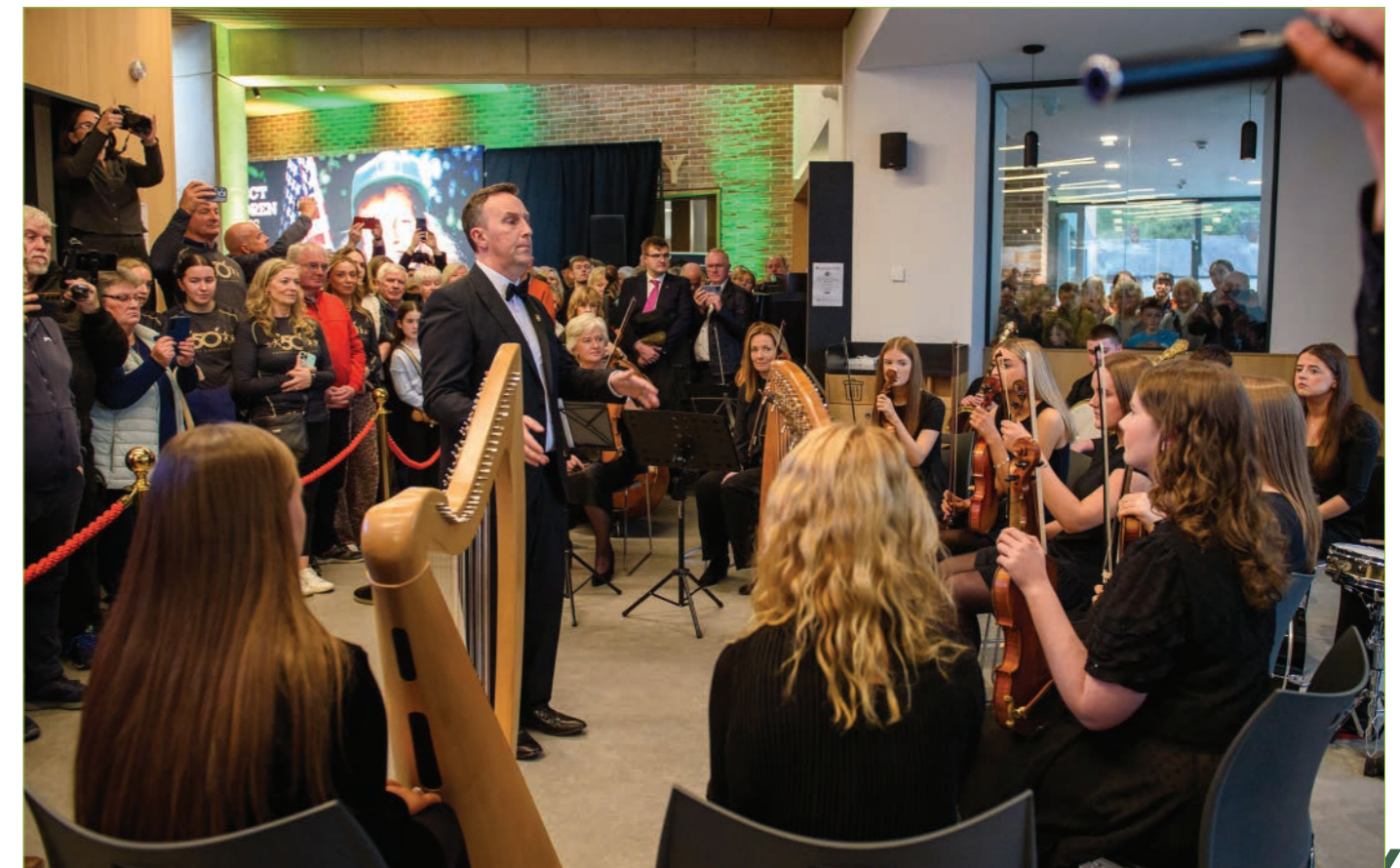
Music Generation Cavan/Monaghan performing at the launch of The Project Children Stories exhibition.