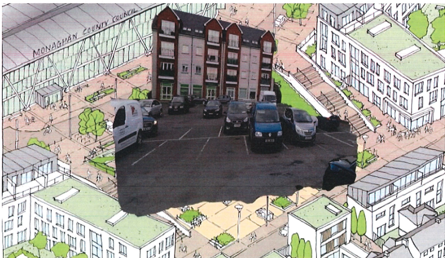
This is fantasy - Its a car park in front of apartments