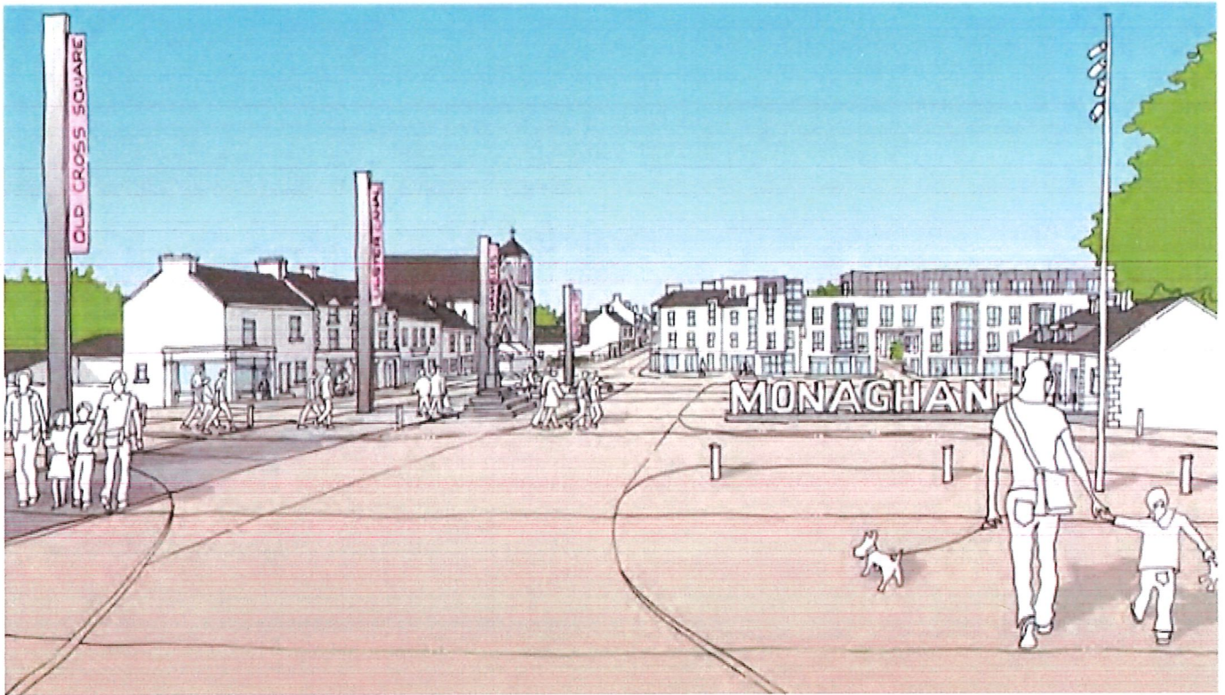
Old cross square with new roads and increase traffic will look like the above!!!!!!!!!!!!!!!!!!!!!!