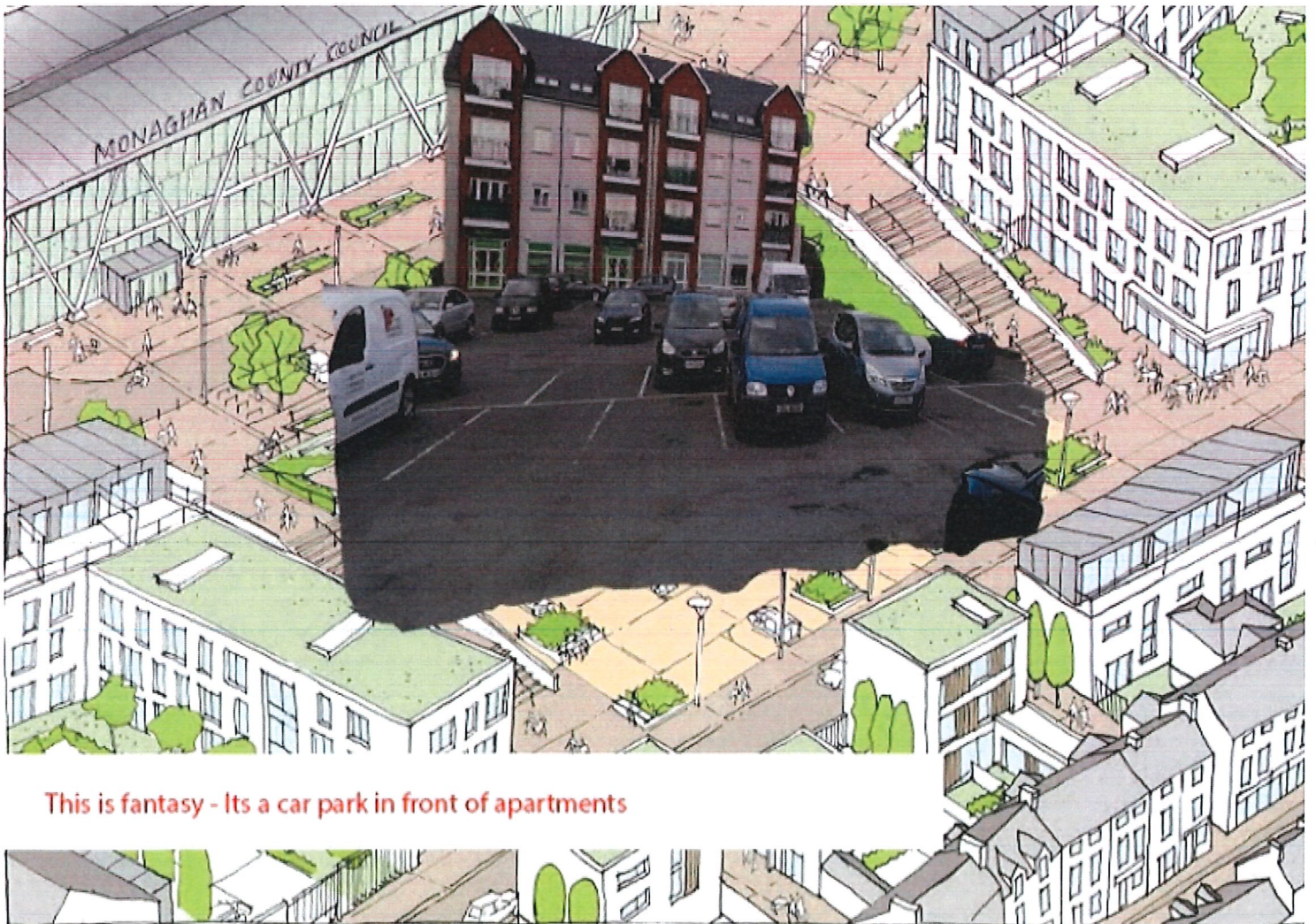
This is fantasy - Its a car park in front of apartments