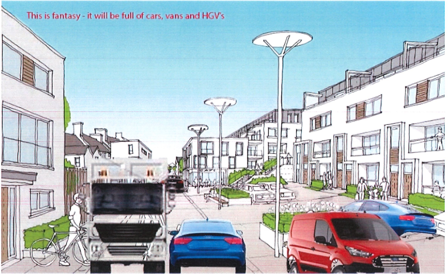
This is fantasy - it will be full of cars, vans and HGV's