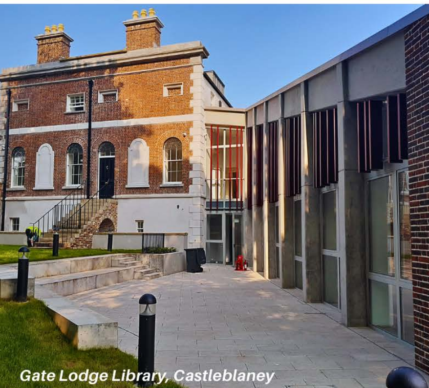
Gate Lodge Library, Castleblaney