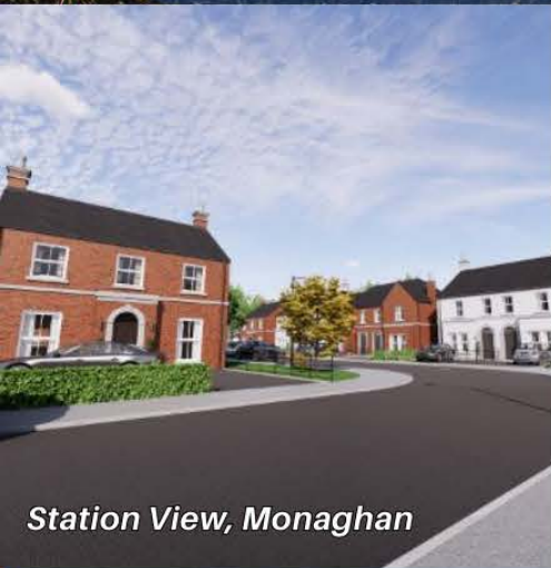
Station View, Monaghan