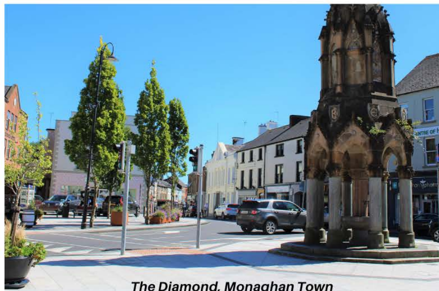
The Diamond, Monaghan Town