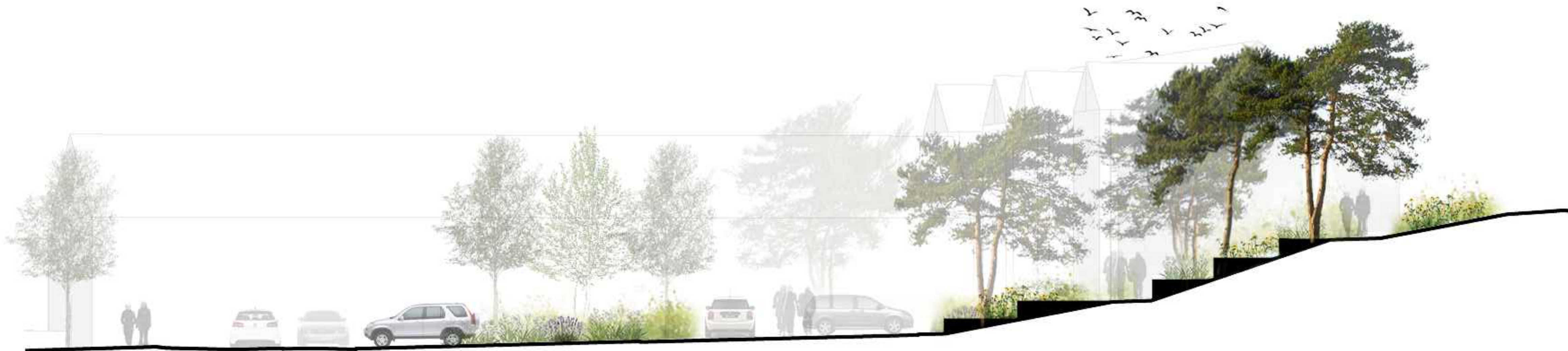
Section 3 1:100 @A1