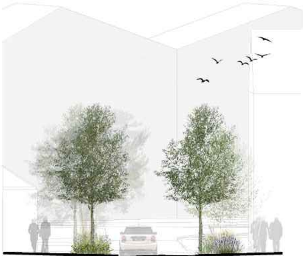
Section 1 1:100 @A1