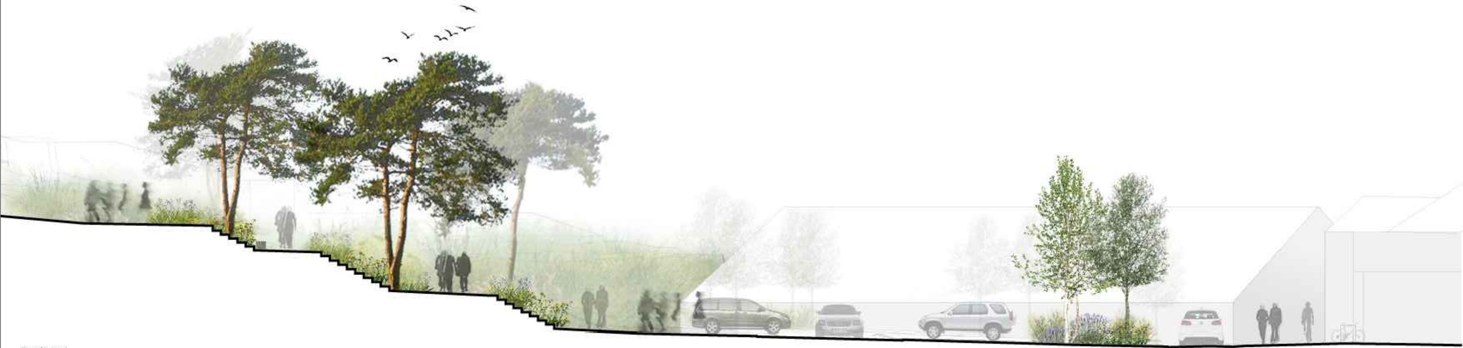
Section 4 1:100 @A1