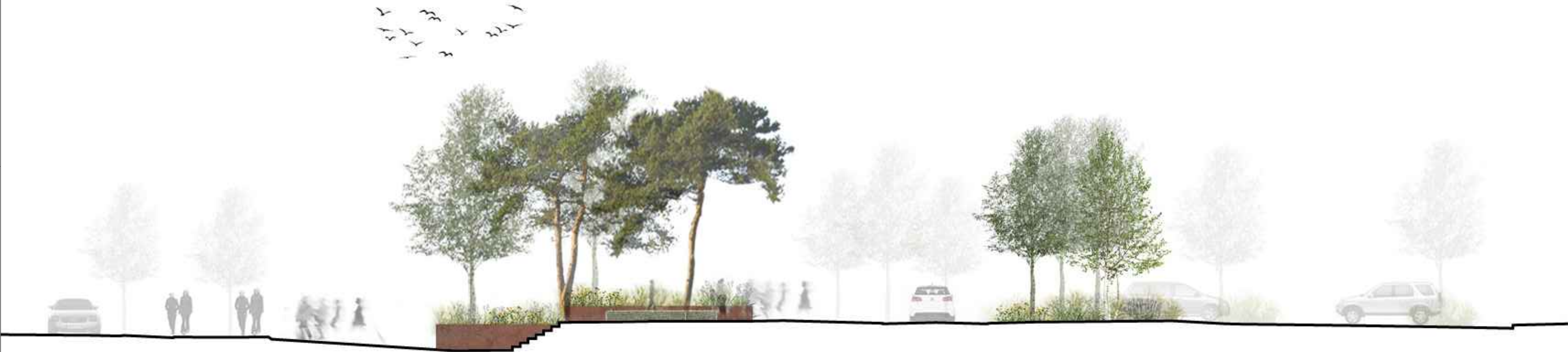
Section 5 1:100 @A1