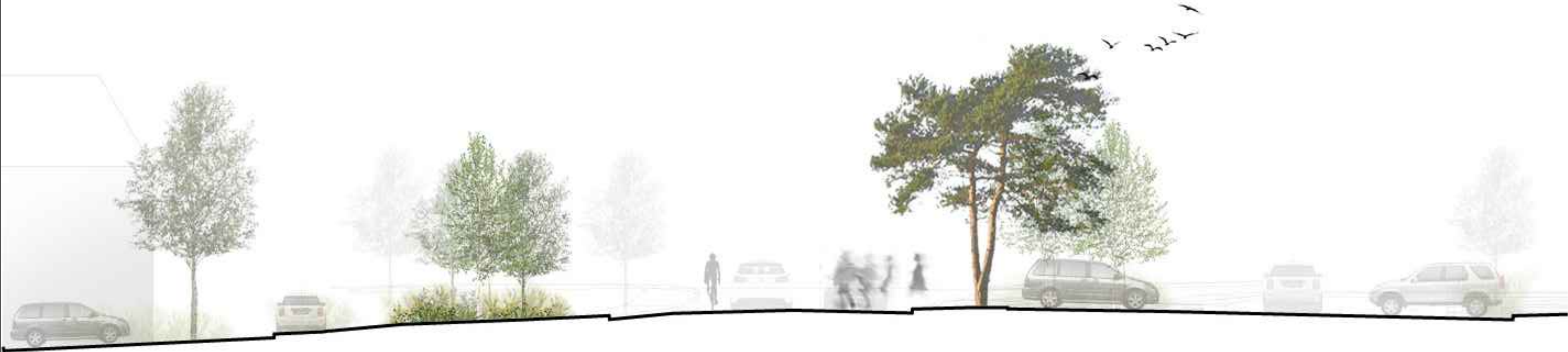
Section 6 1:100 @A1