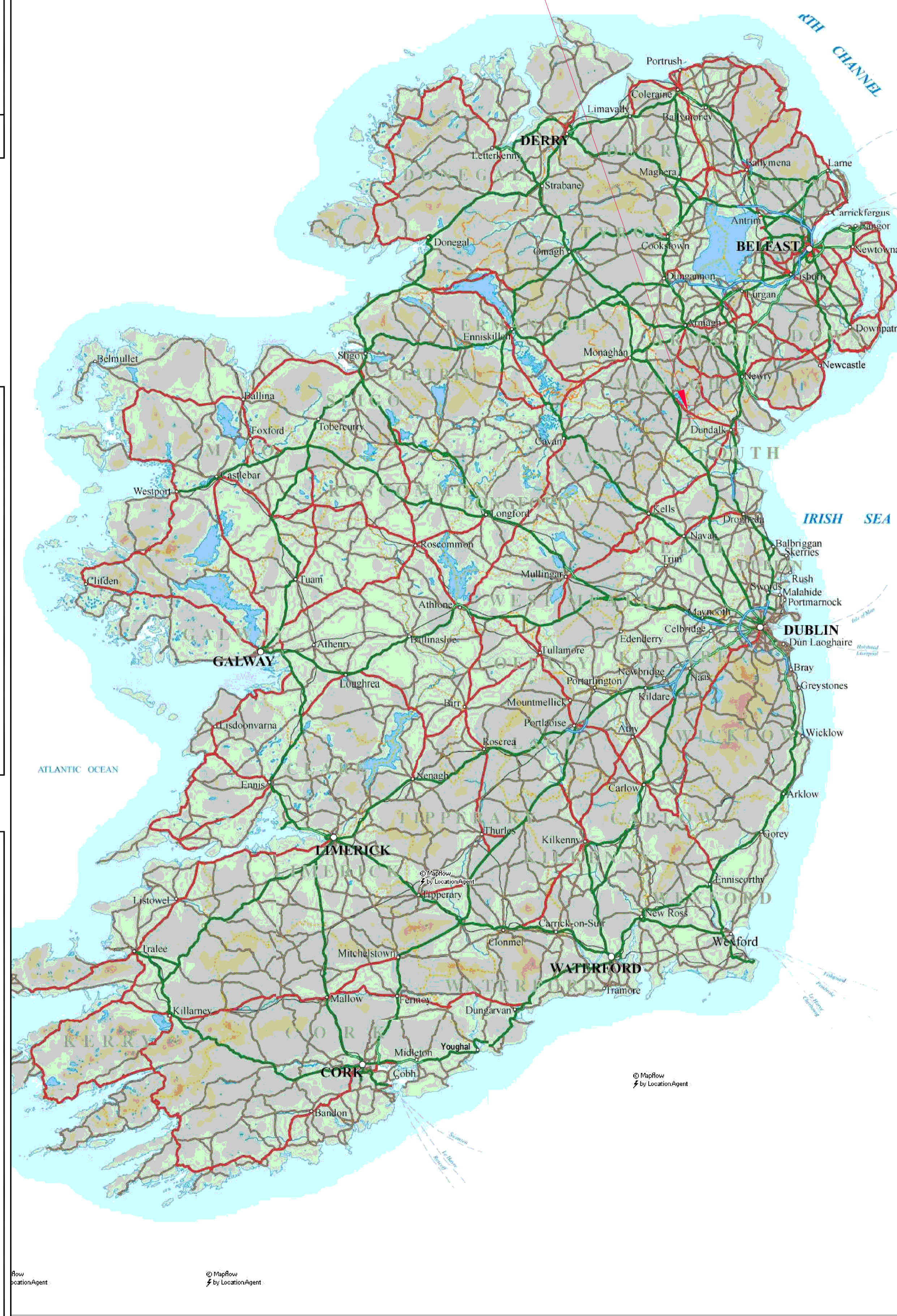
MAP OF IRELAND SCALE 1:1000000