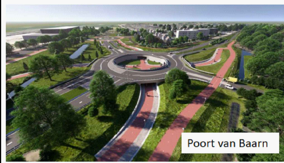
Poort van Baarn