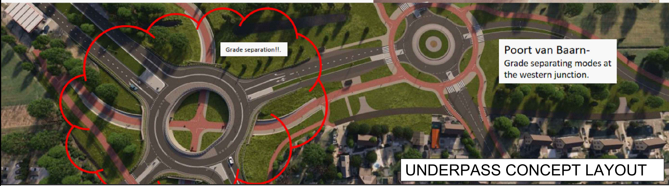
UNDERPASS CONCEPT LAYOUT