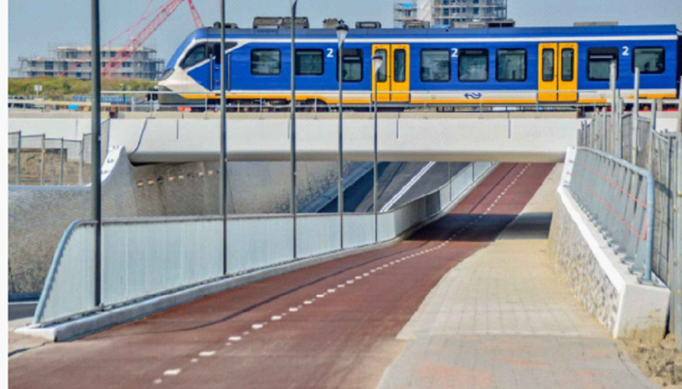
Poort van Baarn - Grade separating modes at the western junction.