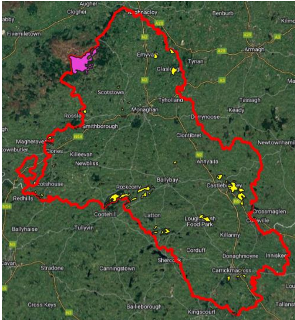
Figure 2. Natural Heritage Area (NHA) and Proposed National Heritage Areas (pNHAs) in County Monaghan