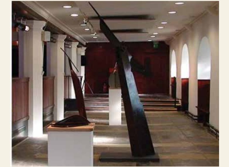
Triskel Arts Centre - Exhibition