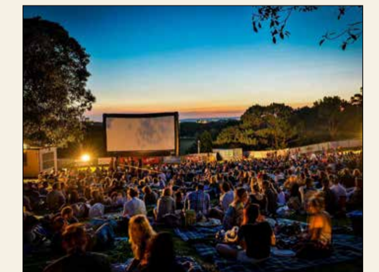
Outdoor Performance Space