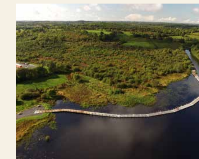
Flood Resistant Boardwalk