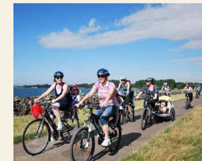
Waterford Greenway Cycleway