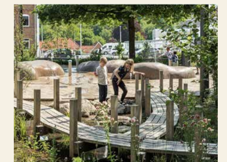
Nature Based Drainage