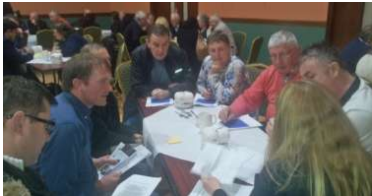
PPN workshop on draft Local Community Plan, Corcaghan, November 2015

Monaghan PPN continued to gather momentum in 2015. Established towards the end of 2014, the PPN was very active in January 2015 with a series of Municipal District meetings where groups were asked to identify the issues facing the community sector in the county, and also how community well-being could be promoted. The results of this process formed the basis for a Community Well-Being Statement which was adopted at a county plenary meeting in March. This work in turn informed a series of workshops which were collated into a submission to the Local Community Development Committee (LCDC). The PPN considered the draft actions in the draft plan later in the year, and again fed its thoughts into the LCDC's planning process.