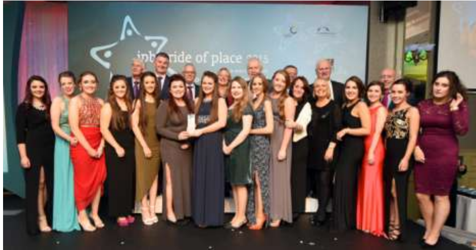
Largy College students accepting their award

Monaghan's strong tradition in community development once again brought success on the national stage at the all Ireland IPB Co-operation Ireland Pride of Place Awards 2015, where Clones' Largy College Young Social Innovators class of 2014 -2015 (Transition Year) took top place in the Young People in the Community Category. This was in recognition for their work both within their school and in the wider community to help de-stigmatise the Lesbian, Gay, Bisexual and Transgender community.