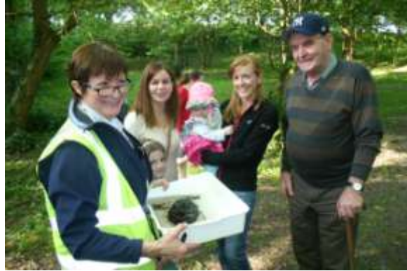
Three generations of one family at Bawn having a look at some of the amazing bugs and wildlife in a sample taken from the river.