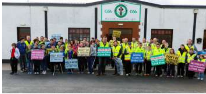
Litter Pick Volunteers Castleblayney By-Pass in May 2015.