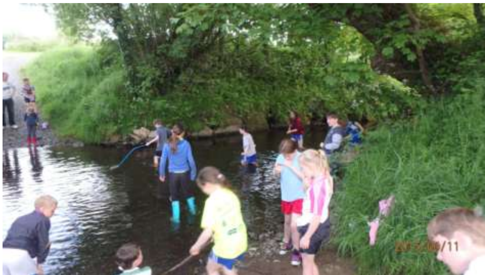
Some local kids in Glaslough getting busy looking for bugs and other wildlife in their local river.