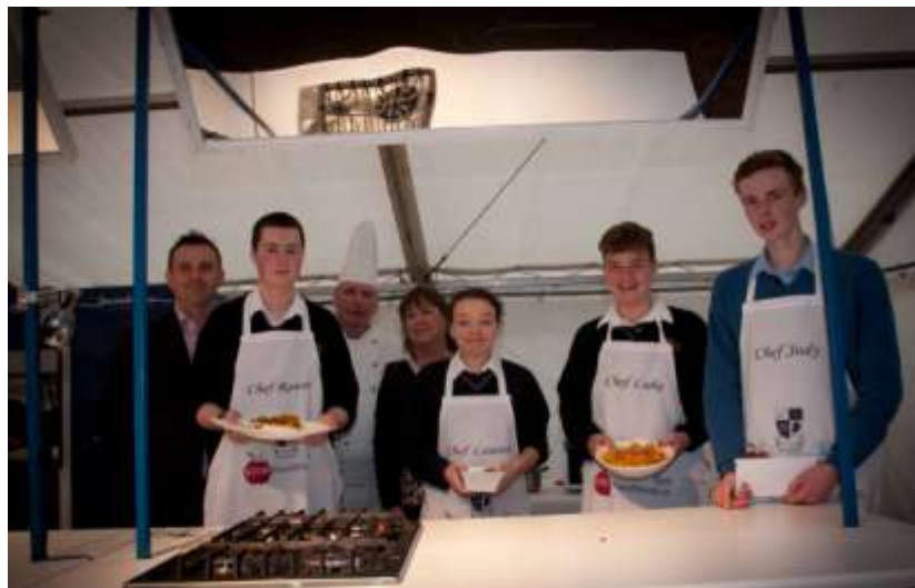
Taste of Monaghan Schools Food Waste Cookery.