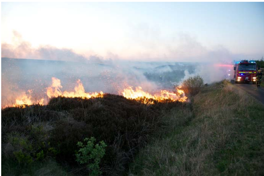
Gorse fires on Bragan

Equally, during the cold weather spells in November and December the fire service responded to emergency calls to provided water supply to domestic dwellings.