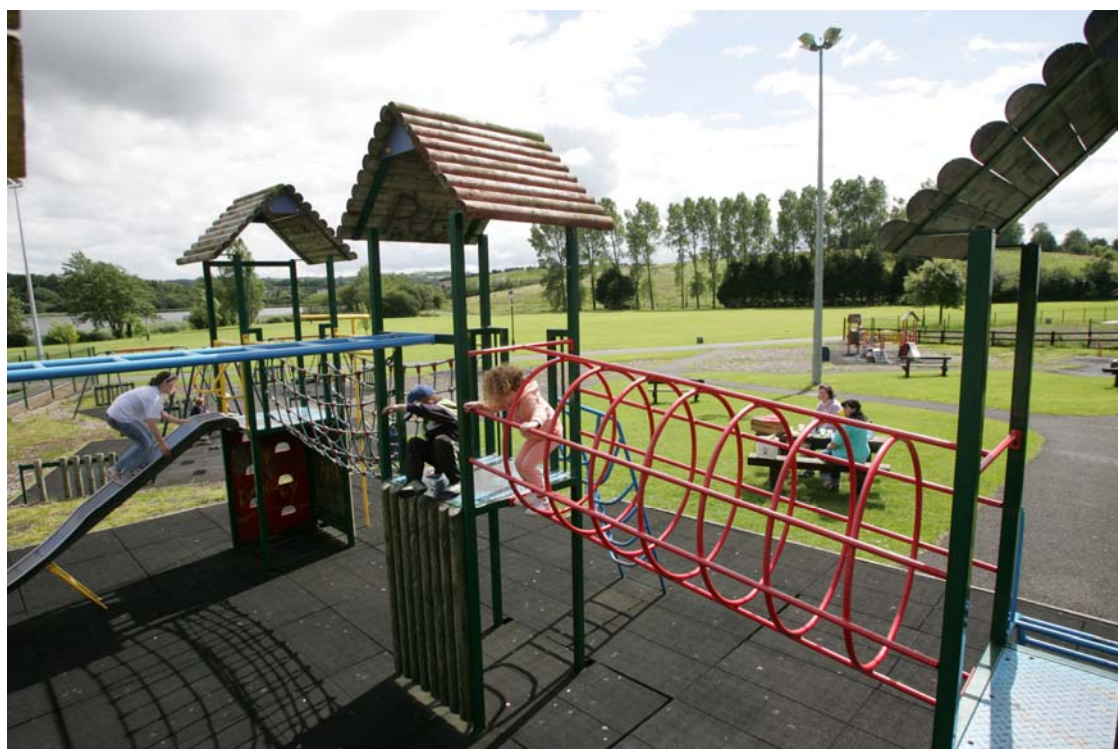
Ballybay children enjoying the play area provided

Following an application under three category headings to the LAMA Awards for 2010, Ballybay Town Park was shortlisted in two of the categories namely 'Best Public Park' and 'Best Public Play Area' but unfortunately did not win either award.