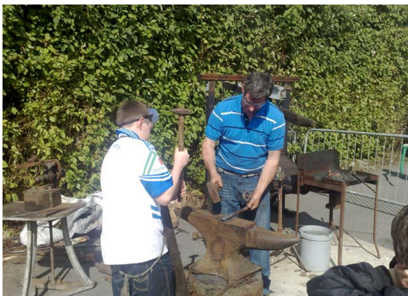
Blacksmith at work during Heritage Day

In connection with the Heritage Week, the museum staff held a Heritage Day in Monaghan Harps Sports Complex. The day attracted over 1,500 visitors. Some of the displays on view included a working threshing machine, a traditional blacksmith's forge, roof thatching, a petting farm, basket making, butter churning, wood turning and many more. This extremely successful event will now become an annual fixture in the museum's event calendar.