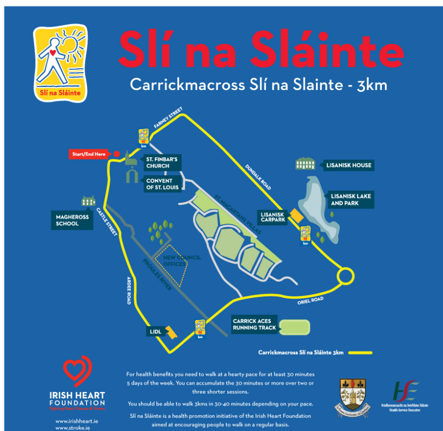
Slí na Sláinte route

At a special presentation held in May, the Council made financial contributions to the various community groups and voluntary organisations throughout the town in the sum of €78,700. This sum included a new allocation to the Chamber of Commerce for the promotion of the town in the sum of €15,000. The Council has provided new storage facilities for the Chambers Christmas lights at the Council's depot on the Ardee Road.