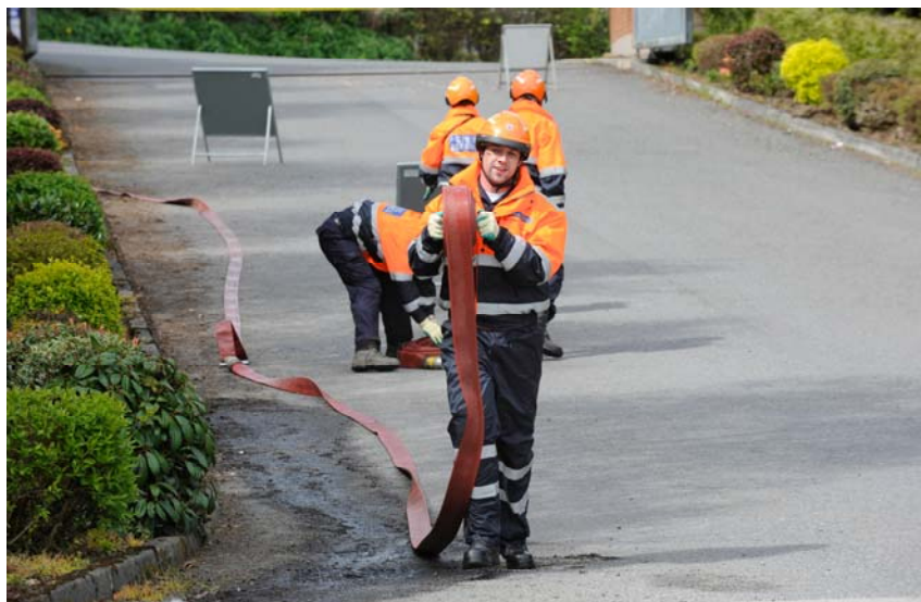
Civil Defence training exercise

Major Emergency Planning training within the county on a shared basis with other relevant sectors of the Local Authority, Fire Service, An Garda Síochana, North Eastern Health Board, and other relevant voluntary agencies.