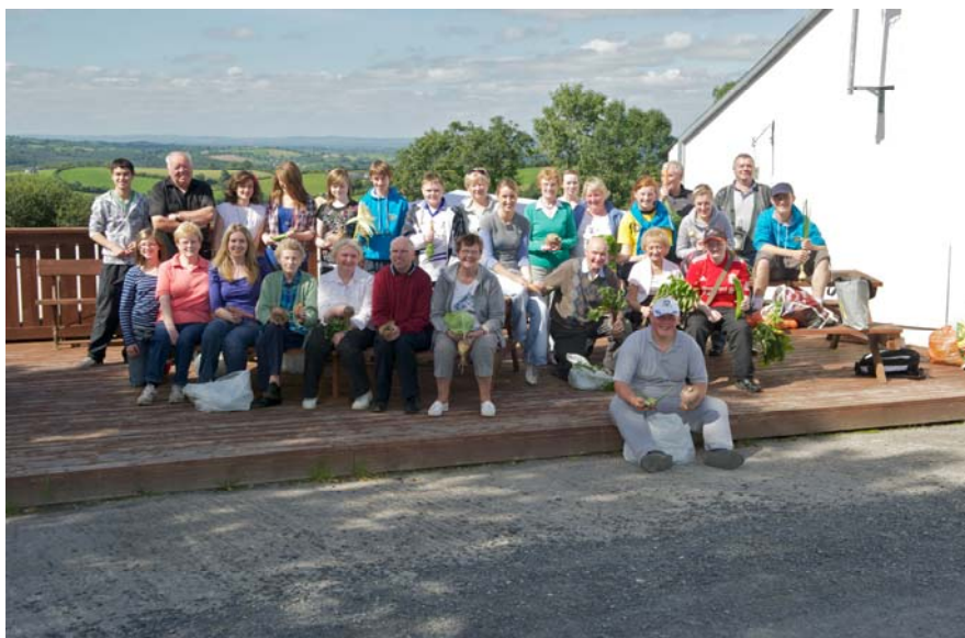
Growing Green Together group