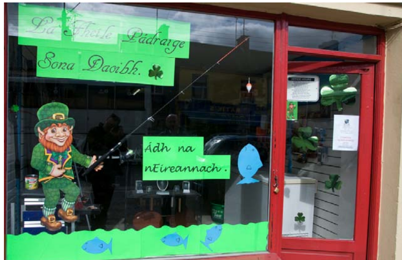
Comórtas na bhFuinneog 2010

Seachtain na Gaeilge 2010 was a success with many significant and worthwhile events organised.