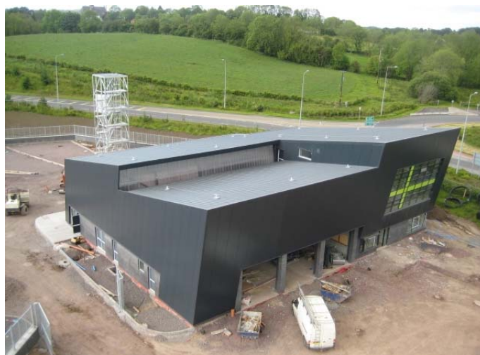
Monaghan Fire station under construction

The North-East regional working group committee held a table-top exercise in the City North Hotel, Co. Meath during November which involved all the three Principle Response Agencies. The main of the exercise was to evaluate the Major Emergency Plan for each of the four authorities in the region.