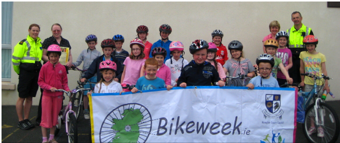
Participants in the Garda Bike Unit lead cycle training

In addition to the public events, the Garda Bike Unit in Castleblayney delivered cycle training in all the primary schools in their district. All 121 pupils and their teachers in St Tiarnach's Primary School in Clones cycled to school. The week, which ran from 13 to 20 June, was a great success, with over 560 people taking part.