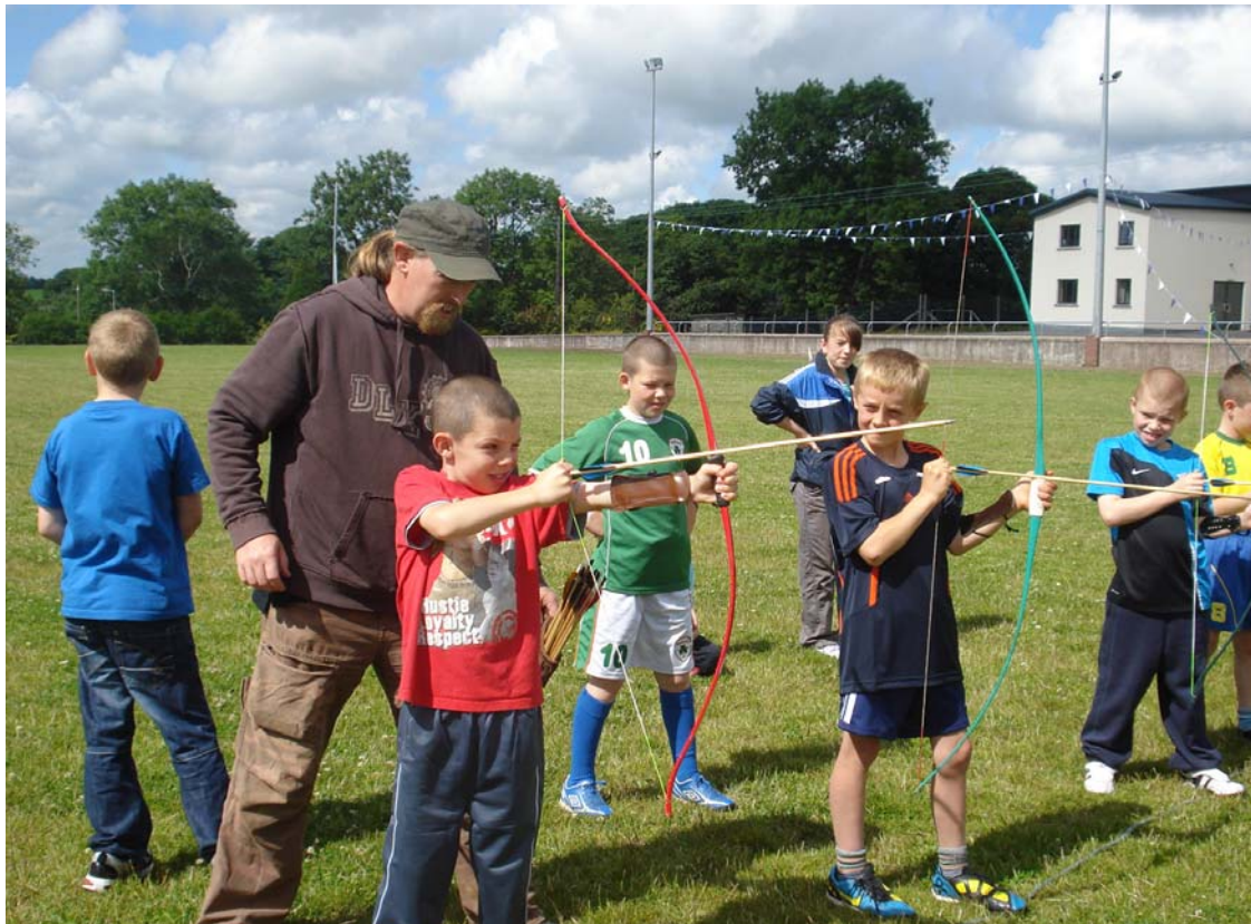
Archery class during Children's summer camp

Behind the scenes the museum staff is constantly working hard to ensure that every object in museum's collection is properly cared for as per the standards set down by the Heritage Council's Museum Standards Programme for Ireland. As the first local authority museum to receive full accreditation under the programme the museum continues to be seen nationally as a leading light in the field of collections care. In 2011 the museum staff will be approached by the Heritage Council and asked to apply for the process of retention. Through this programme the museum staff will be asked to display how they have maintained all 32 standards of professional excellence as well as demonstrating the changes they have made to build on these standards. This will be a challenge that the museum staff are relishing as another opportunity to demonstrate on a national stage the dedication to professional excellence that pervades all our work.