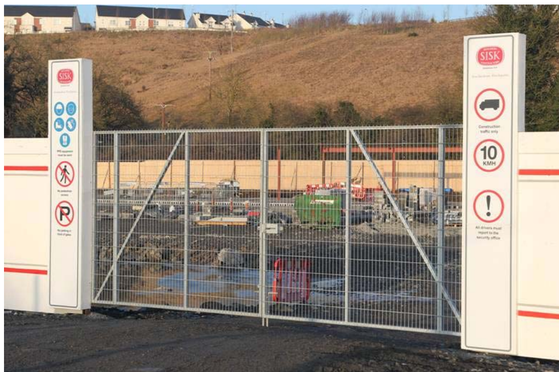
Site for new Town Council Offices