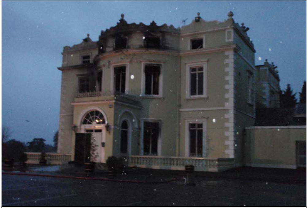
Fire damaged Hope Castle

There were a number of significantly large incidents during the year, most notably the fire at Hope Castle which involved the deployment of 3 No. Fire Brigades from Castleblayney, Carrickmacross, Ballybay and the hydraulic platform from Dundalk Fire Service Castleblayney Fire Brigade where the first alerted to the incident at 3:08am on the 4 th November 2010 and by the time of arrival the entire building had been