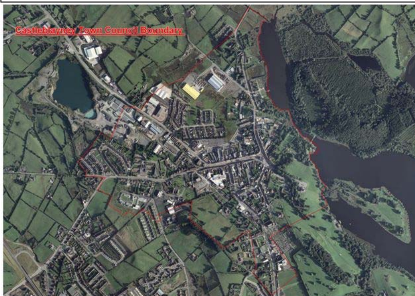
Aerial view of Castleblayney

The council provided funding of €10,000 to the Tidy Town Committee.