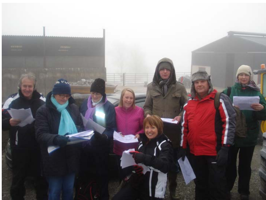
Hidden Heritage field trip

This project, which is part financed by the European Union's European Regional Development fund through the Peace III Programme and funded through Monaghan Peace III Partnership is focussed on bringing communities together through the study of their shared heritage. The four groups from around the county; Magheracloone, Tydavnet, Clones and Latton, continued to work with staff from the museum and library to research aspects of their own local heritage as they continued towards their goal of a larger audio visual display set to be launched in the Museum in April 2011.