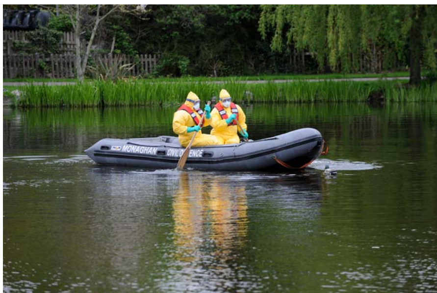
The boat unit in action

Civil Defence visited a number of primary & secondary schools to help promote the organisation and to make the public aware of Civil Defence's work in the community. The Boat Unit continued to provide assistance to Monaghan County Council in the lake monitoring programme, water services, and also at numerous water based events where a rescue boat was required.