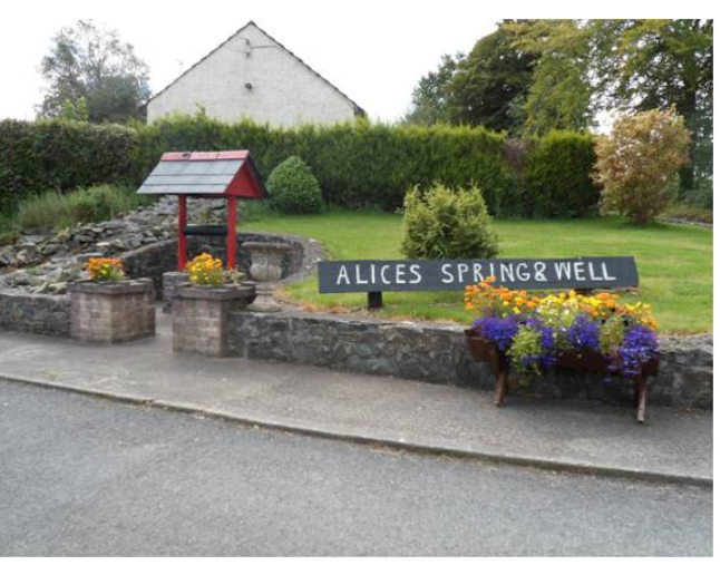
Litter Control: O' Duffy Terrace Residents Association