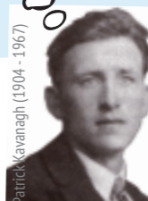
Patrick Kavanagh (1904-1967)