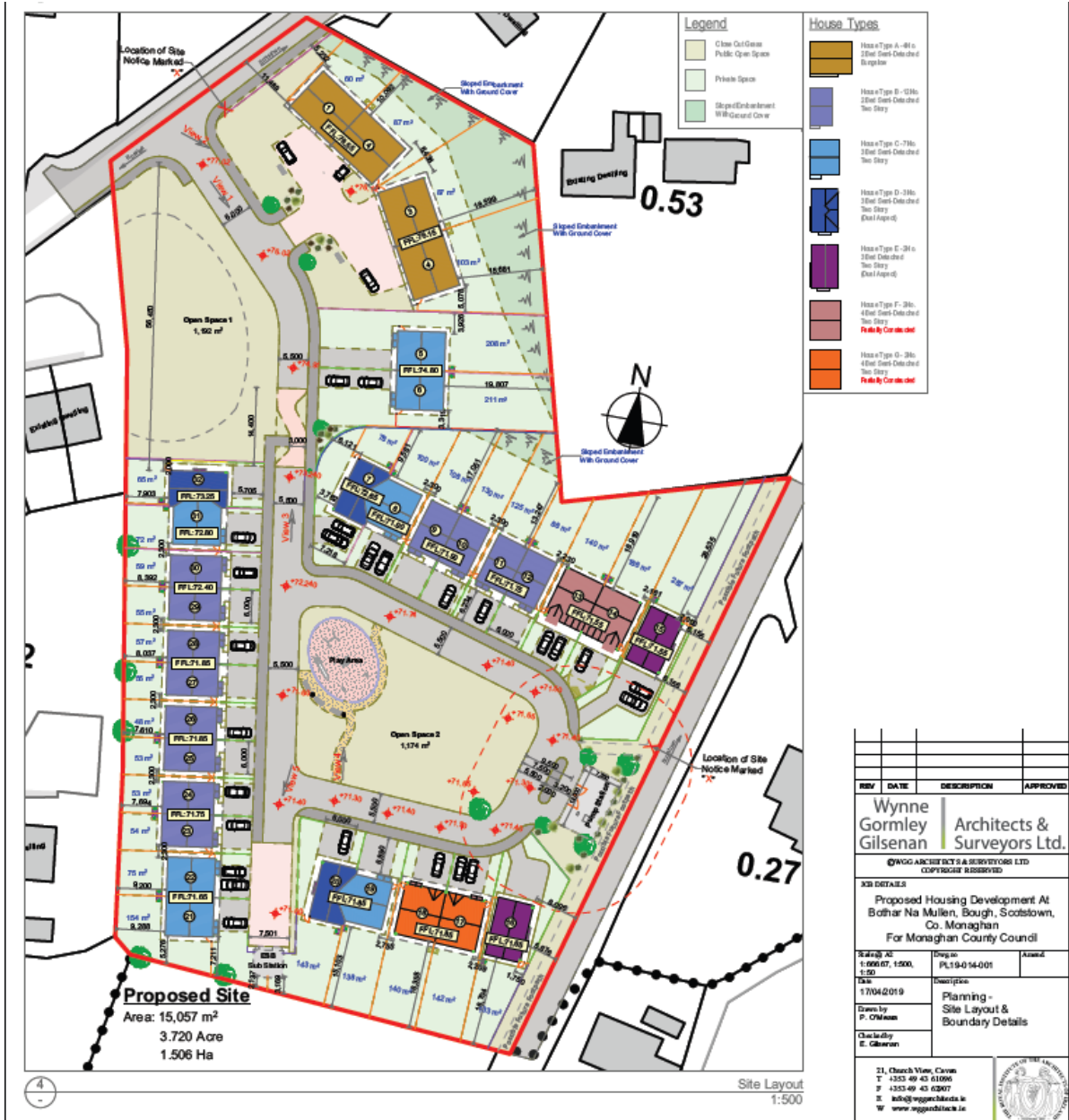
Scotstown Site Layout Plan