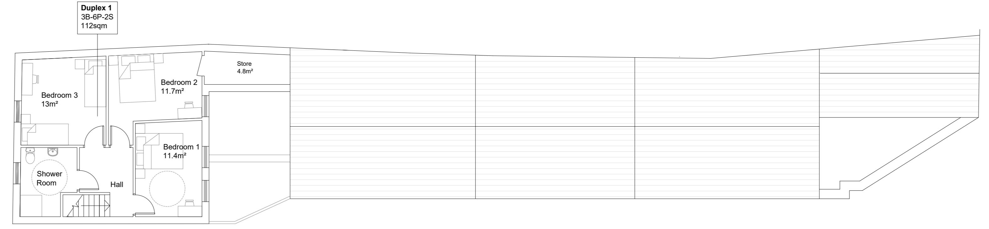
PROPOSED SECOND FLOOR PLAN SCALE 1:100

NOTES 1. All measurements shown are in metres, and all levels are to ordnance datum unless otherwise indicated. 2. All Coordinates are to Irish Grid, unless otherwise noted.