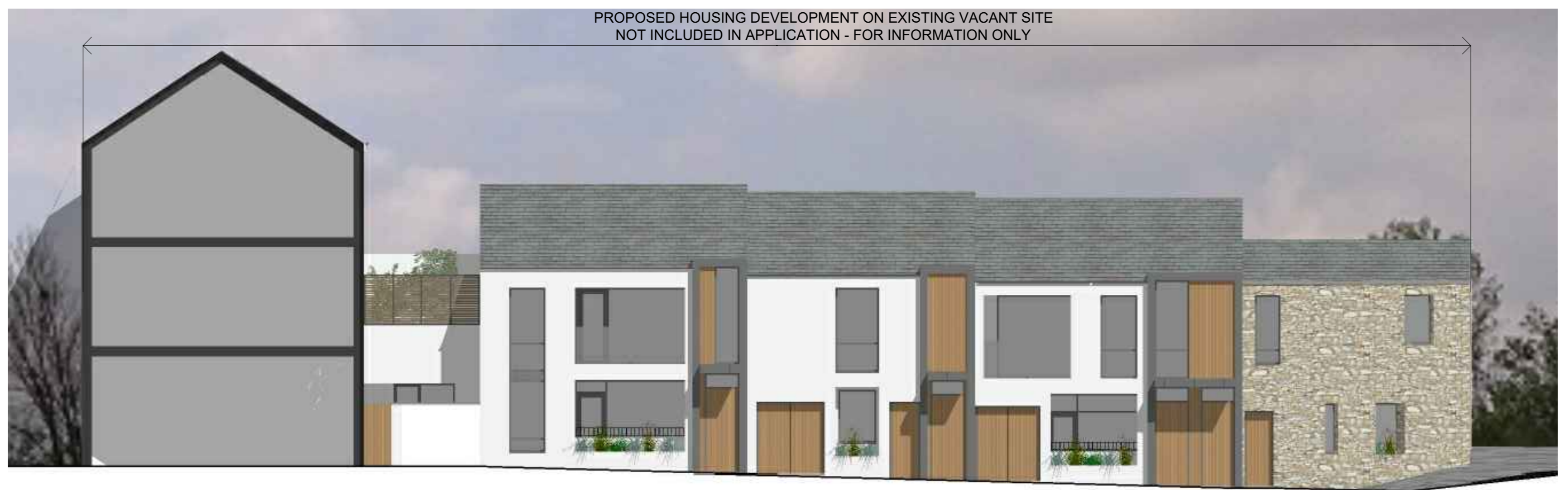
PROPOSED WEST ELEVATION SCALE 1:100