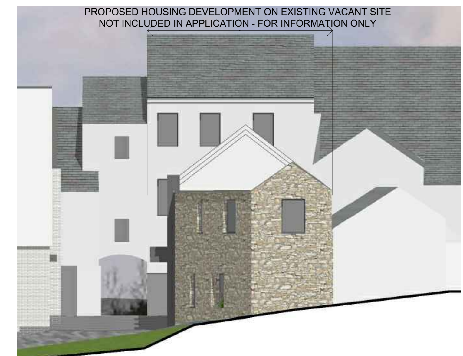
PROPOSED SOUTH ELEVATION SCALE 1:100