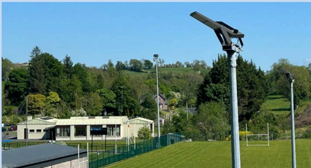
Installation of energy efficient LED sports lights (Killeevan Sarsfields GAA Club)