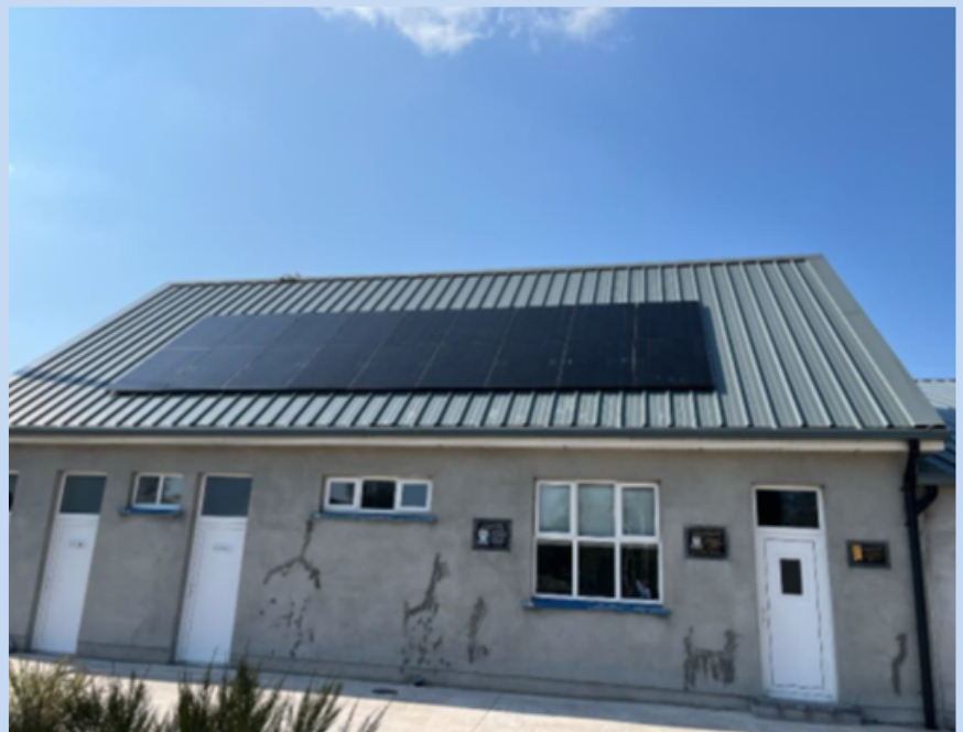
Solar PV System (Killeevan Sarsfields GAA Club)