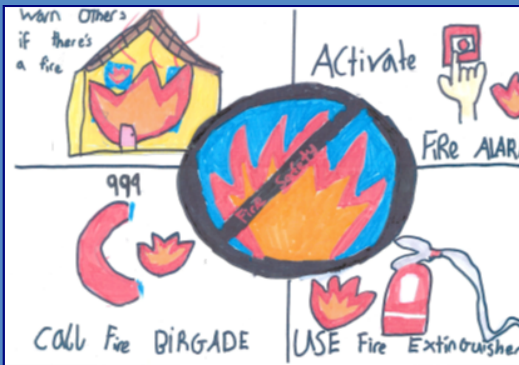
4th Class poster winner from Corracrin NS Oct 2025

MFCP lead National Fire Safety Week in Monaghan County from 13th October – 19th October 2025 promoting fire safety in our homes and communities. This year's campaign carries a powerful message: "Together Against Fire", and highlights the importance of community action in protecting the most vulnerable among us – especially older citizens and those living alone.