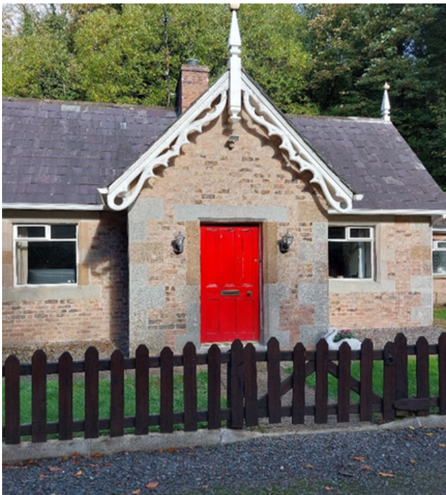
Before photo of Newbliss Gate lodge

The second progress reports for BHIS & HSF 2025 were sent to the Department in September 2025.