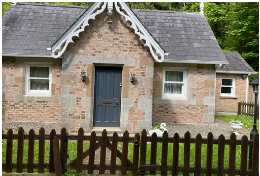
Works complete on Newbliss Gate Lodge (timber sliding sash windows)